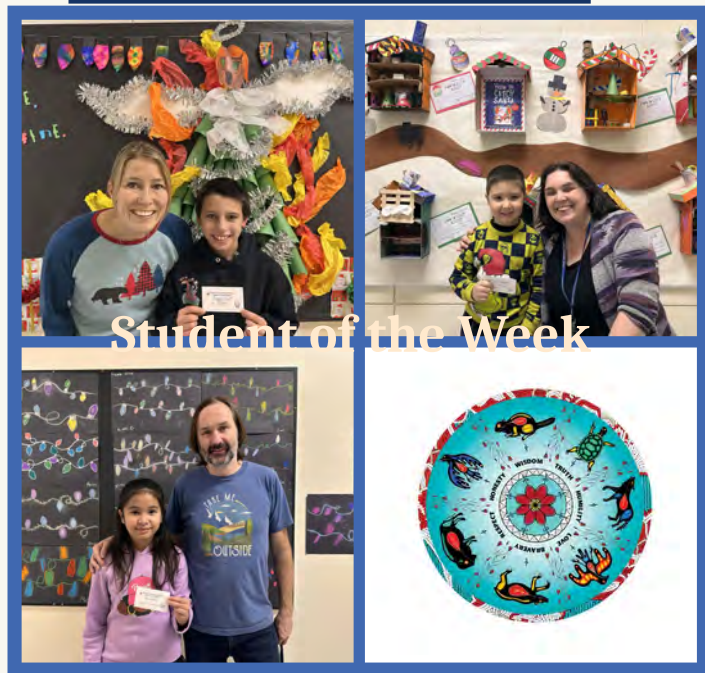
Student of the Week

We are excited to see all our students and staff back at school in 2026.